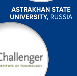
ASTRAKHAN STATE UNIVERSITY, RUSSIA