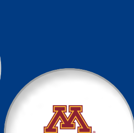
GO Minnesota UNIVERSITY OF MINNESOTA