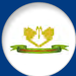
DEDAN KIMATHI UNIVERSITY OF TECHNOLOGY, KENYA