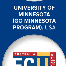
UNIVERSITY OF MINNESOTA (GO MINNESOTA PROGRAM), USA