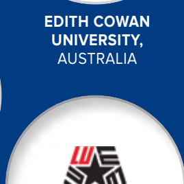
EDITH COWAN UNIVERSITY, AUSTRALIA