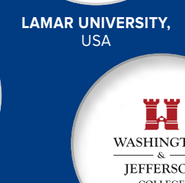
WASHINGTON & JEFFERSON COLLEGE, USA