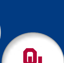
UNIVERSITY OF OKLAHOMA, USA