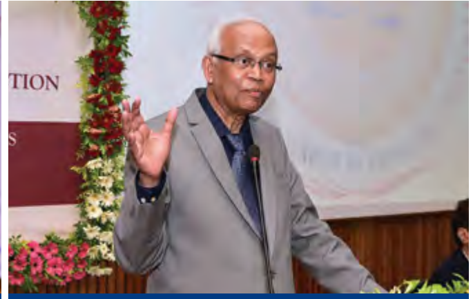
Dr. R A Mashelkar President, Global Research Alliance & CSIR Bhatnagar Fellow