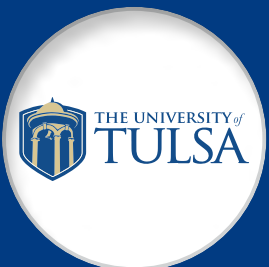
UNIVERSITY OF TULSA, USA