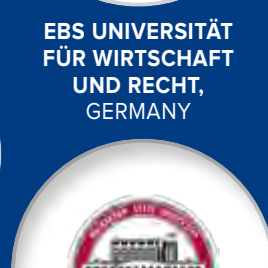
EBS UNIVERSITÄT FÜR WIRTSCHAFT UND RECHT, GERMANY