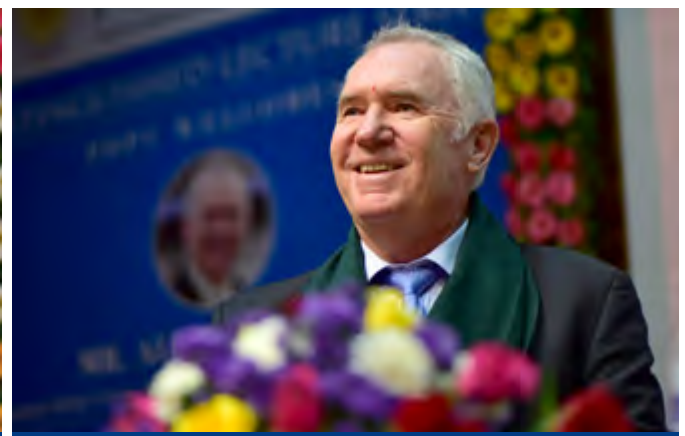
Mr. Allan Border Newland Global Group, Australia & Former Australian Cricket Captain